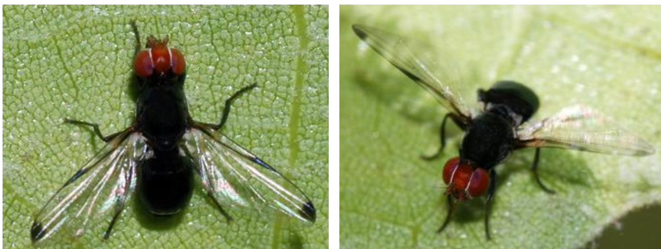
Fig. 4.- Seioptera vibrans (Linnaeus, 1758) on a leaf of Lantana camara L.

Seioptera vibrans was known from Madeira Island and Spain [Carles-Tolrá & Báez, 2002]. This is the first record for mainland Portugal.