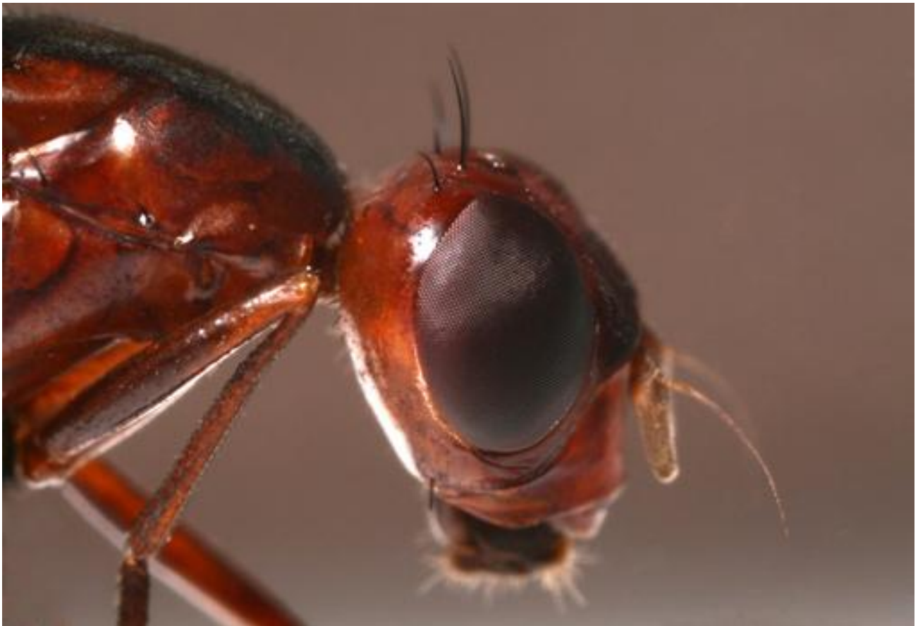
Fig. 1. - Detail of the head of Cephalia rufipes Meigen, 1826, rare fly in Europe.

C. rufipes was found when the author was packing up the Malaise trap. The ulidiid was climbing up the black fabric of the malaise. In a letter to the author, Elena Kameneva noted that there are about 20-25 C. rufipes specimens in the main European collections, mostly old.