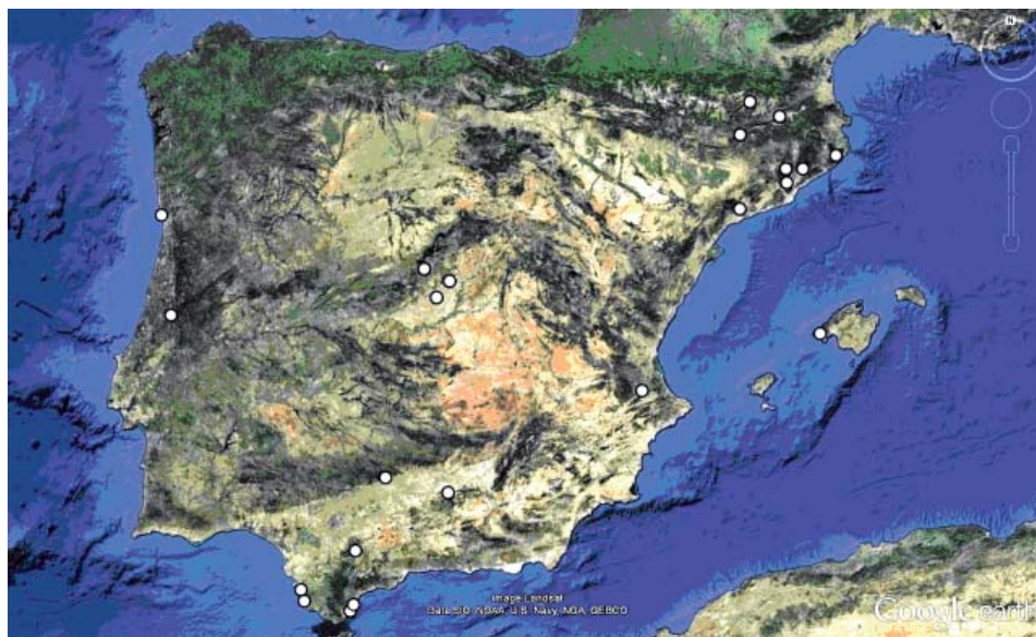
Fig. 3. Iberian distribution of Aradus flavicornis .

Fig. 3 shows that A. flavicornis has a typical Mediterranean distribution in the Iberian Peninsula.