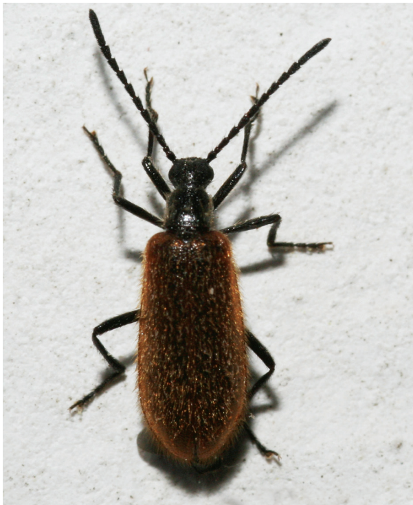
Fig. 9.1. Lagria hirta ♂ (Sassari prov., Villanova Monte Leone, 23.V.2010).

MB PA GN MTr, oe, 4 ex. G55 : 16.V.2008, MB GN PA MTr, oe on Crataegus sp. and Quercus ilex , 4 ex. G56 : 5.IX.2006, GN DA MB DB, dc by night, 1 ex. Sassari prov. : Alghero, Via Lido, Traversa A, 3 m, 32T 442317 4491465, 21.IX.2009, GN LS, dc, 1 ex (CGN); sdb 21.IX.2009, GN LS, dc on outer wall of house, 3 ex (CGN); sdb, 13.IX.2011, GN LS, al on outer wall of house, 1 ex (CGN).