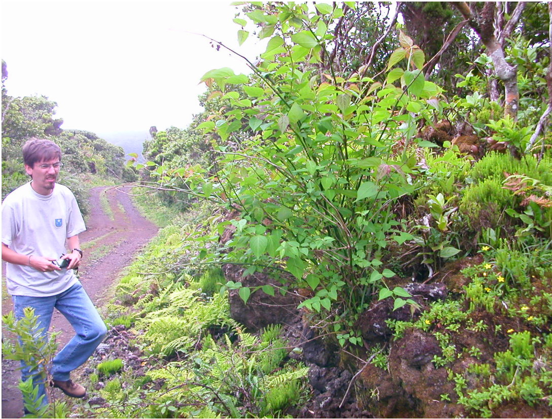
Fig. 1. Photo of an individual of Leycesteria formosa recently detected invading native vegetation in Terceira Island, Azores. The plant was found at Caldeira Guilherme Moniz, close to the trail, in a forest stand dominated by Laurus azorica and Erica azorica .

Dryopteris azorica , D. crispifolia , D. aemula and D. affinis . It is, however, possible that further Leycesteria plants occur at that site, since it is covered by dense native scrubland and forest. Considering the invasive potential demonstrated by L. formosa in São Miguel Island (Fig. 2), it is possible to predict that in the future, if no eradication measures are to be taken, this species will invade the natural stands at Caldeira Guilherme Moniz and in time other natural areas in Terceira Island (Fig. 2). Dispersal of this species occurs by way of endozoochory and hydrochory. Rapid spread is possible due to the considerable ability of L. formosa to grow vegetatively and also to its prolific production of berries, which are very attractive to birds (Ramos 1994; Commonwealth of Australia 2008), leading to efficient seed dispersal. Water runoff associated with heavy rains might also contribute